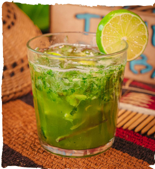
CAIPIRU CACH A DE JAMBU, MACERATED WITH JAMBU LEAVES, LEMON AND SUGAR SYRUP (JAMBU IS A LEAF THAT NUMBS THE TONGUE. IT IS ALSO USED IN TACAC ). $26,90