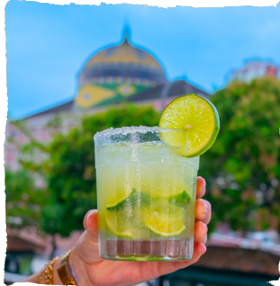
CAIPIROSKA VODKA, LEMON AND SUGAR SYRUP. - BRAZILIAN VODKA R$19,90 - IMPORTED VODKA R$30,90