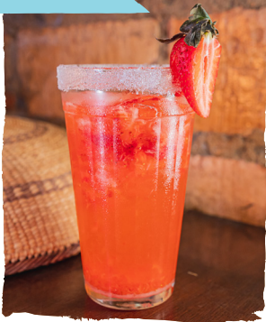
CAIPIFRUIT FRUIT (PINEAPPLE, STRAWBERRY OR PASSION FRUIT), VODKA, LEMON AND SUGAR SYRUP. - BRAZILIAN VODKA R$36,90 - IMPORTED VODKA R$56,90