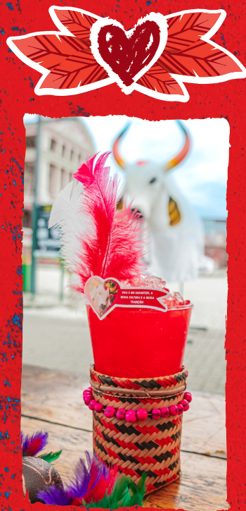
FESTEJO VERMELHO ALCOHOLIC: KETEL ONE VODKA WITH GRAPEFRUIT AND ROSES, STRAWBERRY PUREE, LEMON JUICE, SUGAR SYRUP AND SPARKLING WINE. R$38,90 NON-ALCOHOLIC: STRAWBERRY PUREE, LEMON JUICE, SUGAR SYRUP, AND SODA. R$28,90

GARANTIDO IS PURE FEELING, MIXED BRAVENESS AND SORROW WARRIOR PEOPLE OF ARROW AND LOVE