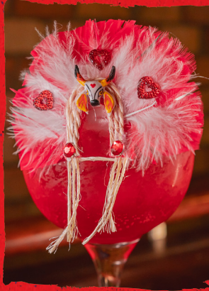
ISA A BELA GUERREIRA ALCOHOLIC: GIN, RED CURA  O, SQUEEZED LEMON, WATERMELON ENERGY DRINK, PINK PEPPER, DEHYDRATED SICILIAN LEMON, CITRUS FOAM AND GUARANTEED HEADDRESS. - GIN TANQUERAY R$61,90 - GIN EURYDICE R$52,90 NON-ALCOHOLIC: STRAWBERRY SYRUP, LEMON, WATERMELON ENERGY DRINK AND LEMON FOAM AND GUARANTEED HEADDRESS. R$40,90