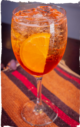
APEROL SPRITZ APEROL, SPARKLING WINE, SPARKLING WATER AND ORANGE. $38,90