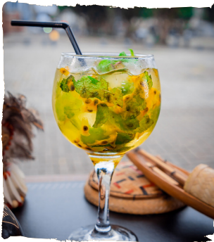
LA PASSION TANQUERAY GIN, PASSION FRUIT, TONIC WATER, MINT AND SUGAR SYRUP. R$46,90