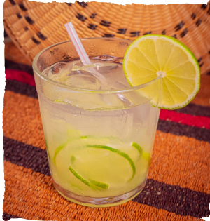
CAIPIRINHA CACH A, LEMON AND SUGAR SYRUP. - TRADITIONAL R$17,90 - SPECIAL R$20,90