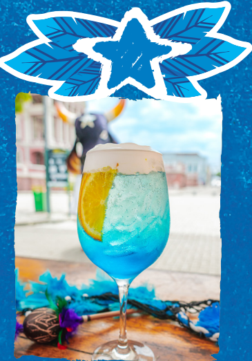
TRIUNFO DO POVO ALCOHOLIC: GIN, ORANGE SYRUP, GINGER SYRUP, SPARKLING WINE, SPARKLING WATER, BAHIA ORANGE, STAR ANISE, LEMON FOAM AND THEMED RICE PAPER. - GIN TANQUERAY R$61,90 - GIN EURYDICE R$54,90 NON-ALCOHOLIC: ORANGE SYRUP, GINGER SYRUP, SODA, BAHIA ORANGE, STAR ANISE, LEMON FOAM AND THEMED RICE PAPER. R$28,90