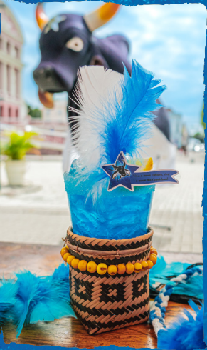
EVOLU   ESTRELADA ALCOHOLIC: TEQUILA, BLUE CURA  O, LEMON JUICE AND RIM SALT. R$36,90 NON-ALCOHOLIC: ORANGE SYRUP, LEMON JUICE, SODA AND RIM SALT. R$28,90

CAPRICHOSO IS THE LIGHT, IS THE SOUND WHO TAKES OVER MY LAND THE DRUM ROLLS LOUDLY, LOVE SHINES BRIGHTLY THAT THE WAR DRUMS ARRIVED