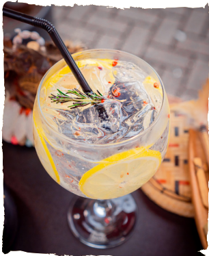
LE MAGNIFIQUE! TANQUERAY GIN, TONIC, LEMON, PINK PEPPER AND ROSEMARY. R$46,90