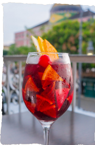
SANGRIA WINE FLAVORED WITH CINNAMON, BAHIA ORANGE, SICILIAN LEMON, NUTMEG, STAR ANISE, BROWN SUGAR AND GREEN APPLE. R$48,90