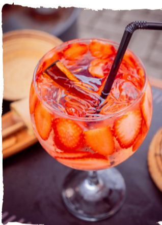
L'AMOUR ROSE BEEFEATER PINK GIN, STRAWBERRY, TONIC AND TORCHED CINNAMON. R$65,90