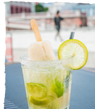
CAIPILE LEMON & GRAVIOLA CAIPIRINHA WITH SOURSOP POPSICLE. - TRADITIONAL R$28,90 - SPECIAL R$36,90