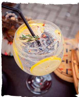
LE MAGNIFIQUE! TANQUERAY GIN, TONIC, LEMON, PINK PEPPER AND ROSEMARY. R$56,90