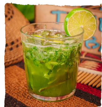
CAIPIRU CACHAÇA DE JAMBU, MACERATED WITH JAMBU LEAVES, LEMON AND SUGAR SYRUP (JAMBU IS A LEAF THAT NUMBS THE TONGUE. IT IS ALSO USED IN TACACÁ). R$29,90