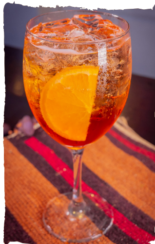
APEROL SPRITZ APEROL, SPARKLING WINE, SPARKLING WATER AND ORANGE. R$48,90