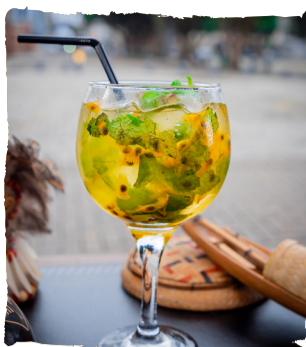
LA PASSION TANQUERAY GIN, PASSION FRUIT, TONIC WATER, MINT AND SUGAR SYRUP. R$56,90