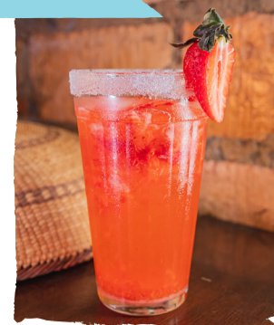
CAIPIFRUIT FRUIT (PINEAPPLE, STRAWBERRY OR PASSION FRUIT), VODKA, LEMON AND SUGAR SYRUP. - BRAZILIAN VODKA R$39,90 - IMPORTED VODKA R$59,90