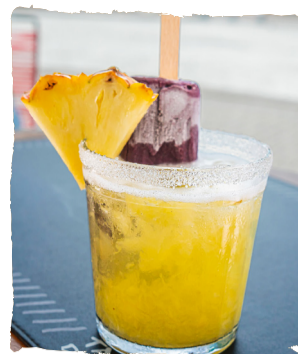
CAIPILE PINEAPPLE & AÇAÍ CACHAÇA, PINEAPPLE, SUGAR SYRUP AND AÇAÍ POPSICLE. - TRADITIONAL R$28,90 - SPECIAL R$36,90