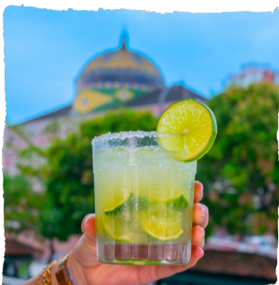
CAIPIROSKA VODKA, LEMON AND SUGAR SYRUP. - BRAZILIAN VODKA R$22,90 - IMPORTED VODKA R$35,90